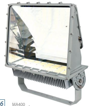
IP 66 MA400

Ports, Airport aprons, Container terminals, Sporting facilities, Parking lots